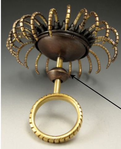
Ball and socket joint, allowing the top part of this sculptural ring to move and rotate at any angle.