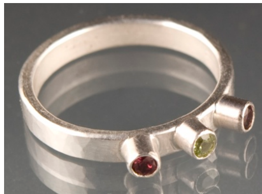
Silver ring with tube set rhodolite garnet and peridot