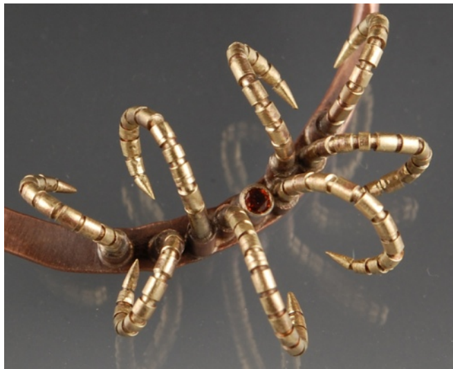
Closeup of a brooch with a tube-set garnet